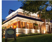
Main Street Inn is one of the stops in Parkville!