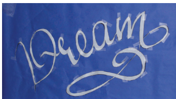
Visionary selections come from the Wooldridge Center Dream Board

A mother's dream is to see her children grow to be happy and successful.