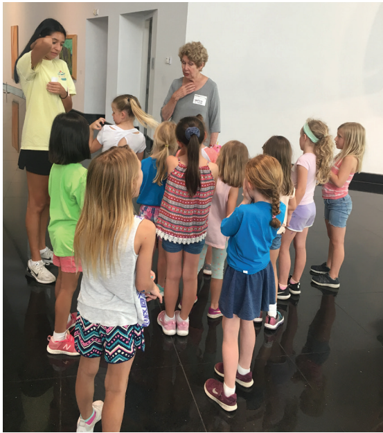
Viking Voyager kids visit the Kemper Art Museum.