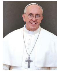
From the Pope's Pulpit:

Take care of yourselves for a future that will come, and remembering in that future what has happened will do you good.